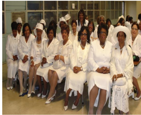
Acadiana Area Founders Day – Acadiana Area Founders’ Day was held February 23 in Lafayette. Twenty-one ladies registered and nineteen traveled to Lafayette to attend the 25 th Annual Area Founders’ Day. Lake Charles Branch placed 3 rd in attendance.