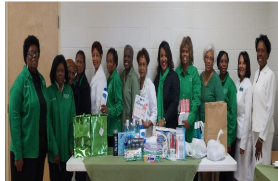
Members stand around items collected for the November Outreach items