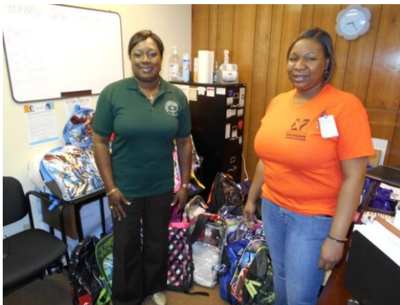
SC Planning and Training Meeting